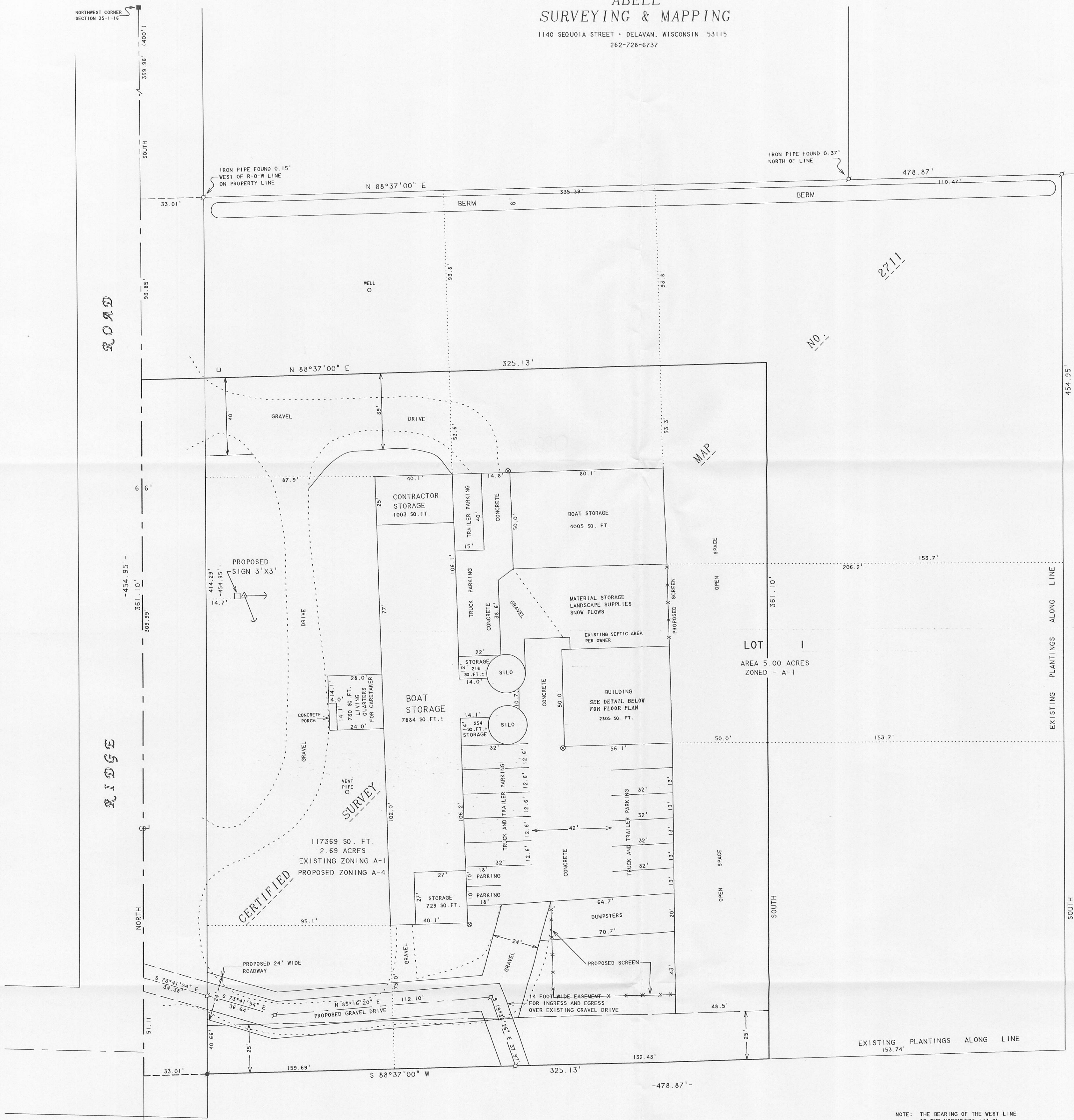
DETAIL FOR FLOOR PLAN